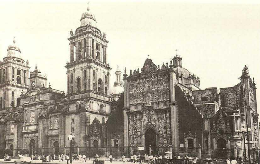
Mexico City, Catedral Metropolitana