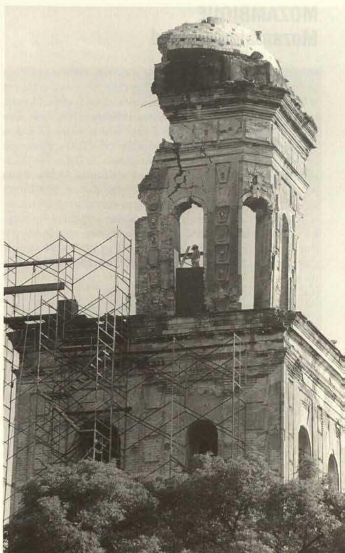
Tower of San Augustin in Puebla after the earthquake of 1999 (see also Heritage at Risk Report 2000 )

The same tower during its repair in 2001