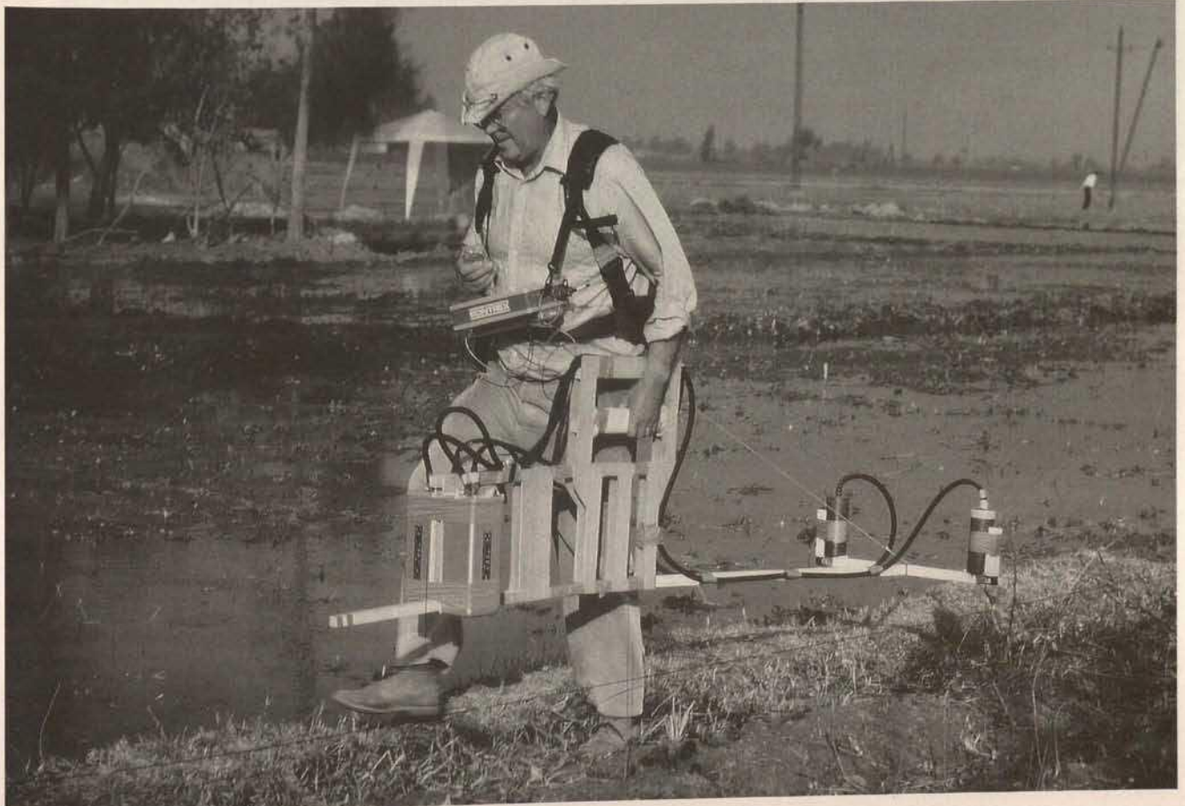
Fig. 2. Caesium Magnetometer Scintrex SM4G-Special with duo-sensor configuration and manual distance triggering every 5.0 m, sensitivity 10 pT (picotesla) at a cycle of 0.1 sec

The archaeological interpretation of the magnetograms (original and corrected data and a set of highpass filtered data) mainly done by the professional egyptologist Dr. Edgar Pusch may be extremely detailed and various – sometimes even with several building phases and stratas. Considering the tiny partition of 50 hectare (0.5 square km) compared with the extension of the area of the whole metropolis with about 30 square km, the variety of identified buildings and quarters of the city is surprisingly high. “The existence of vast living quarters with villas, gardens, wells and smaller houses aligned along streets as well as lakes and “empty” areas which are tentatively interpreted as harbours or old river beds of the Nile partly with reinforcements of the banks, all East of the excavated site Q IV which in itself contains a huge royal horse stud as excavated during the last 10 years. The region south of Q IV and Q I is covered by vast buildings of unknown function. Those may be interpreted as temples, parts of palaces or administrative buildings, possibly even the famous Foreign Office as depicted in the tomb of Thay at Thebes. Also clearly discernible are two huge halls with several hundred mud brick pillars each at the northern edge of the meas-