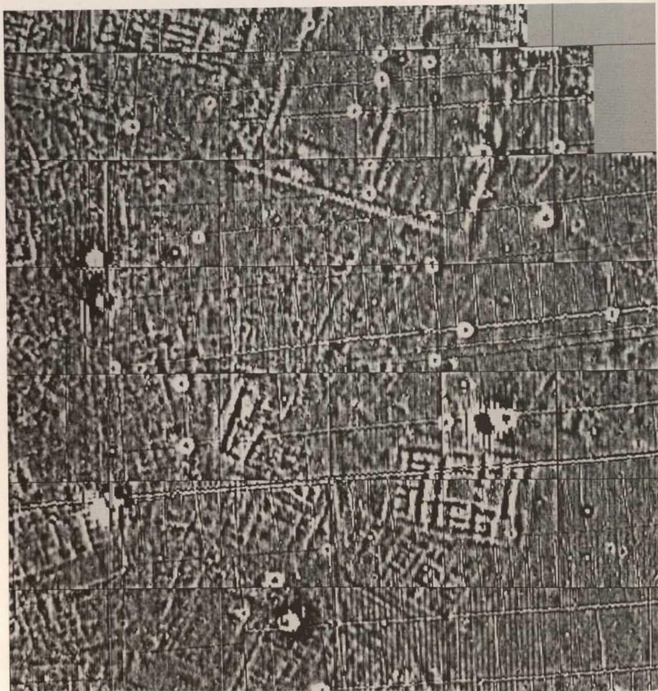
Fig. 5. Qantir-Pirameses East 1997/1998. Magnetogram of the same data as fig. 4, but highpass filtered data 10 x 5 pixel, technical data see Fig. 3a, 3b