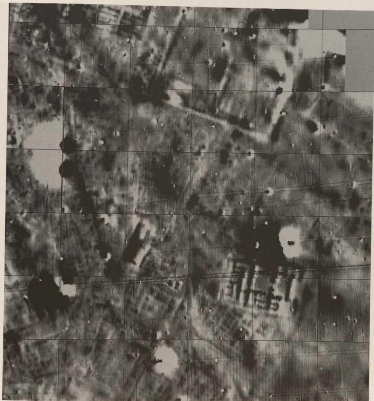
Fig. 4. Qantir-Piramesses East 1997/1998. Magnetogram as digital image with 256 grayscales of a district of the Ramesside capital with Amarna type villas, streets, channels, houses, workshops and a temple building (?) in the centre: original data corrected (40 m grid)

ured area of 1997, which are similar to the so-called Coronation Hall at Tell el-Amarna. Thick enclosure walls and several buildings of definitely the same date are visible in the centre, while the southern and western edge are destroyed by a water way or channel dating to late Roman or even Islamic times according to pottery recovered from it at site Q I' (Pusch et al. 1999).